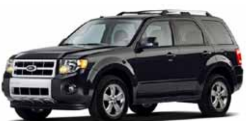
NEW 2012 FORD ESCAPE

Ford of Clermont is conducting a special private invitation only event with 0% APR available on most Vehicles. Our records indicate you own a <Variable Vehicle> worth <variable FAIR> and it has never been worth more. At Ford of Clermont your trade is worth up to (Variable EXCELPlus). Just bring in your vehicle to the location listed below and pick out the new or pre-owned vehicle you want to buy or lease. Similar arrangements will be made for lease customers. Bring your title, check book or payment book and be prepared to take immediate delivery. This is a private event and will not be advertised to the general public. This will be your only notification. Plus, stop in and check your number to see if you have won $4900 cash!