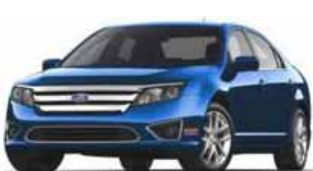
NEW 2012 FORD FUSION