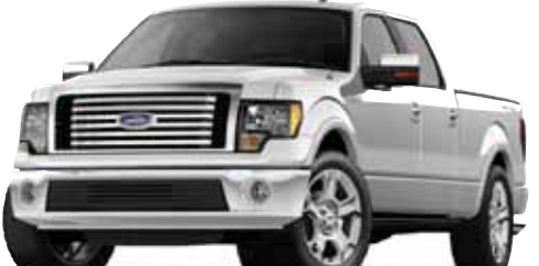
NEW 2011 FORD F150